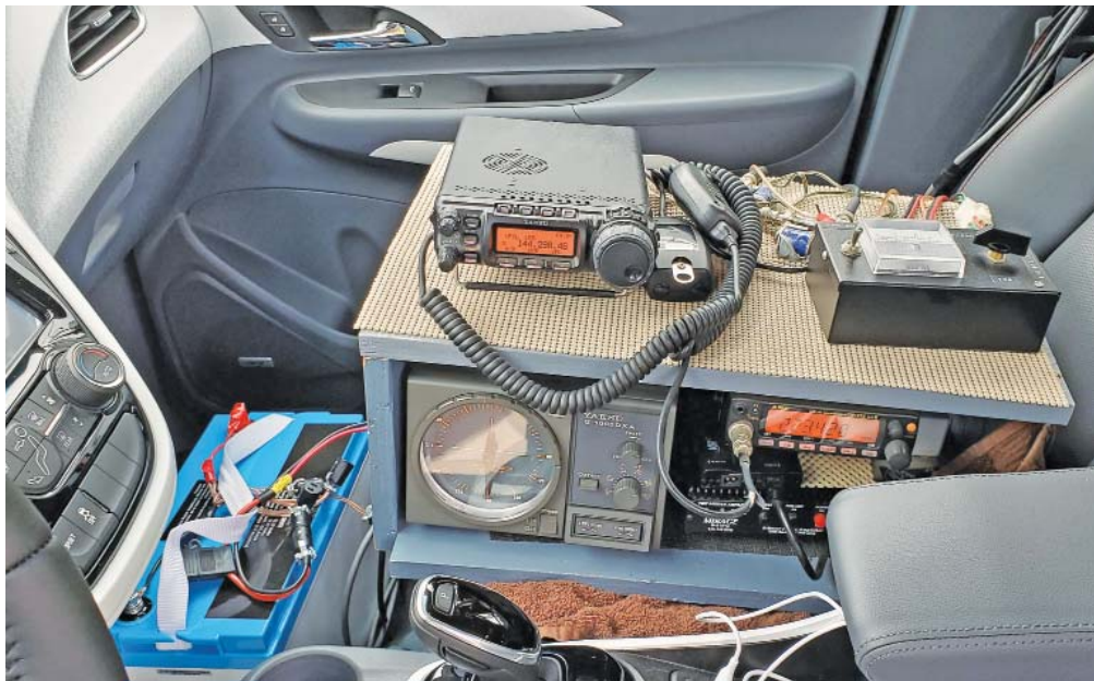
This console controls the 10-band toolbox setup on the roof, providing instant band-switching. There's also a transceiver for straight-through operation on 6 meters, 2 meters, and 432 MHz, and acts as the IF for all bands above 902 MHz.

Almost every other manufacturer is rushing to challenge Tesla in the all-electric marketplace, encouraged by state and federal rebate programs and incentives to get people to switch to Earth-friendly cars. There are also ways to recharge these cars using clean electrical power sources.