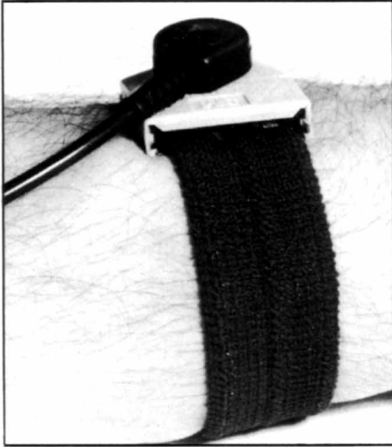
Fig 6—A conductive wrist strap in use. The strap should fit snugly to ensure good electrical contact.