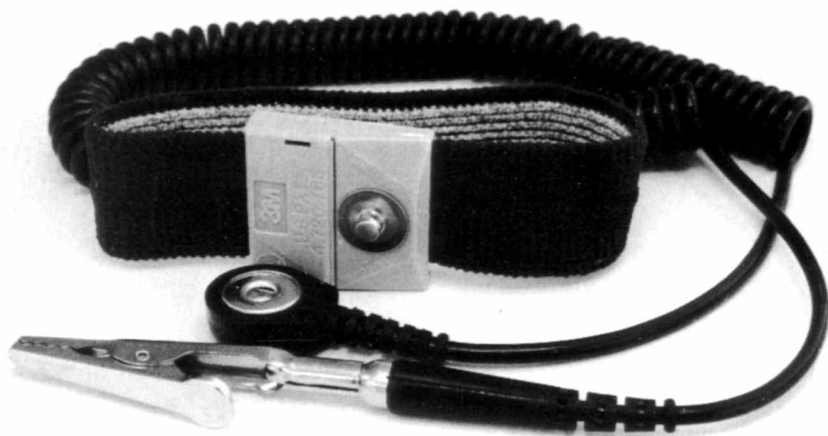
Fig 5—Conductive wrist straps are an inexpensive and effective means of dissipating static charges from the body. In this assembly, a 1-M \Omega resistor has been molded into the plastic cap on the ground-cord snap fastener. When the alligator clip is connected to ground, static charges on the body are bled to ground through the resistor.