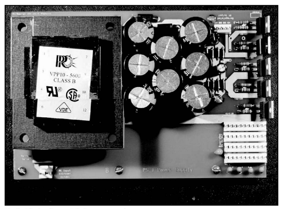
Fig 2—Photo of completed power supply.

The PCB has holes for six #4-40 mounting screws. Use all six so that the transformer and output connectors are adequately supported. Use <sup>3</sup>/s-inch or longer standoffs so that the ac input