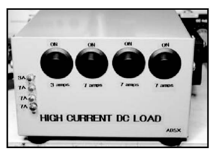
Figure 6 — Front panel view showing control and indicator layout.