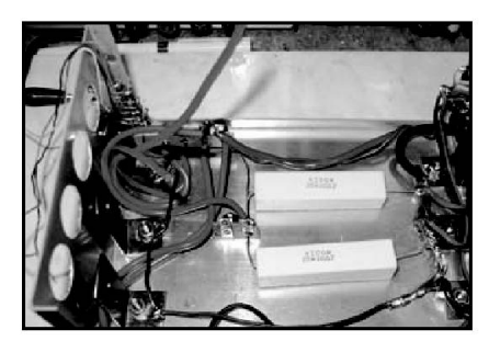
Figure 2 — Internal view showing wiring before switches and 2 \Omega resistors are installed.