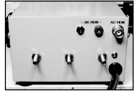
Figure 7 — Rear panel with connectors.

voltage drops in the 16-gauge wiring. Other than this suggestion, the wiring is not particularly critical.